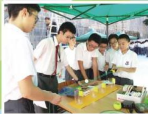
Joint Clubs Exhibition on 29 Sep 2017