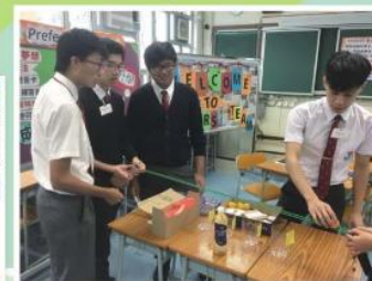
St Louis School 90th Anniversary Open Day on 11-12 Nov 2017